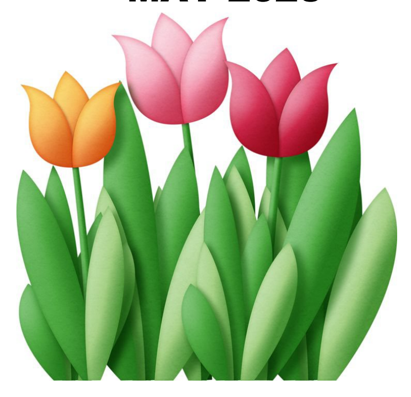
June Issue Submission Deadline: Monday, May 22, 2023