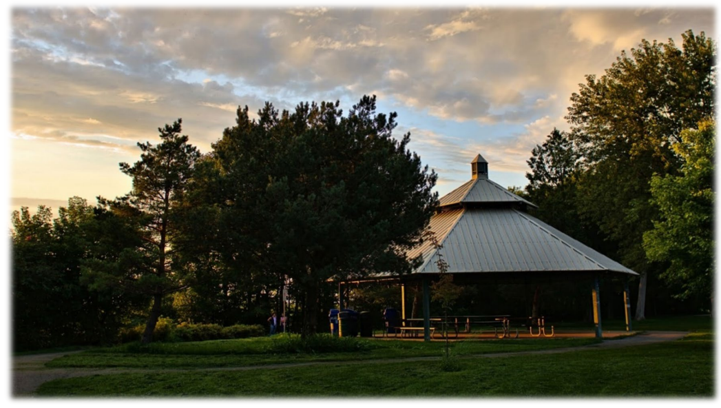
All are invited to participate in Emmanuel's One-day Local Nature Pilgrimage