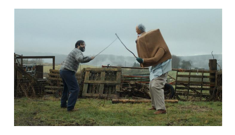
Mark your calendar for future movie nights.

Brian and Charles is a quirky little British film set in rural Wales. Brian is a shy, reclusive inventor of many original items (such as a flying cuckoo clock) that he builds with lost objects and trash that he picks up. One day he builds himself a robot, who takes the name of Charles Petrescu and becomes Brian's best (and only) friend. Together they have adventures, find love and romance for Brian and fight for justice against the village bullies. Highly rated by critics and audiences. This is a sweet, funny and uplifting film that will be enjoyed by the whole family. Suitable for all ages. Bring your friends. Entry to the film is free and popcorn and snacks will be available for purchase.