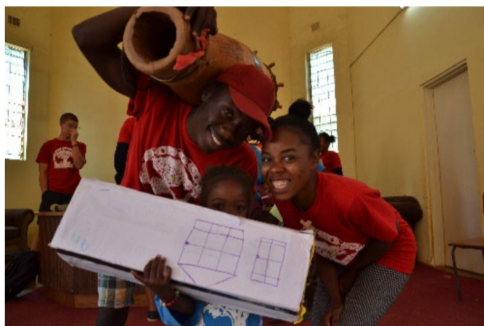
Zambian Leaders & Campers packing up at the end of the day

In the case of b) or c), please indicate in the comments field or on a note what you are sponsoring and that it is for Camp Chipembi. Tax receipts will be provided.