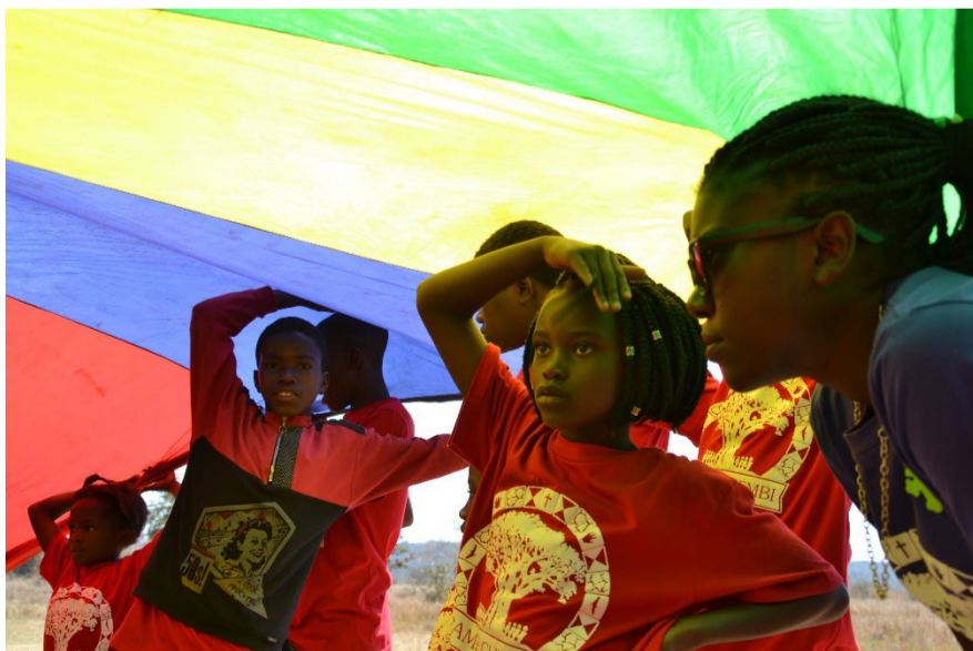
Camp Chipembi Sports Day 2017