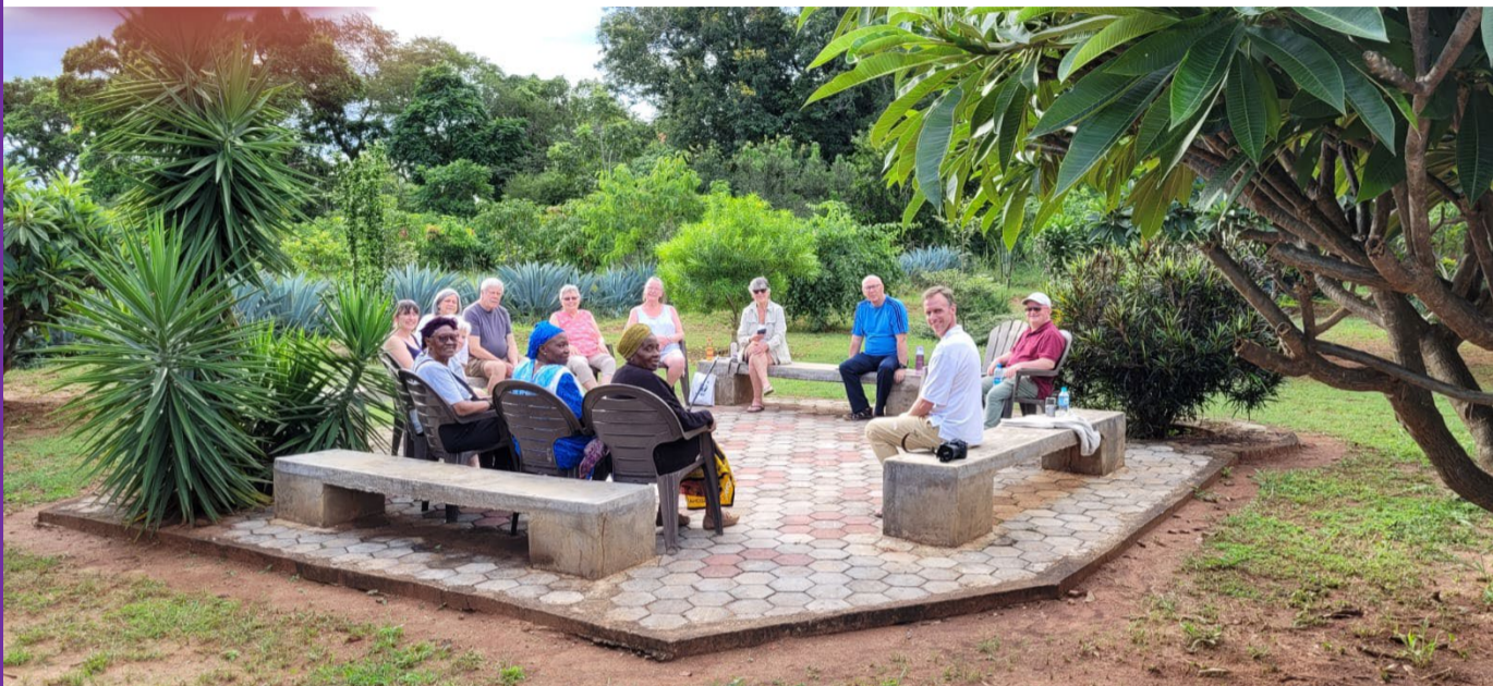
taken on the March 2025 Pilgrimage to Chipembi, Zambia

May Issue Submission Deadline: April 21, 2025